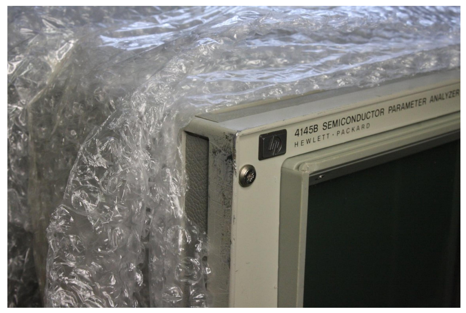
ANOTHER bad impact damage to the front frame. This one to the lower left corner.