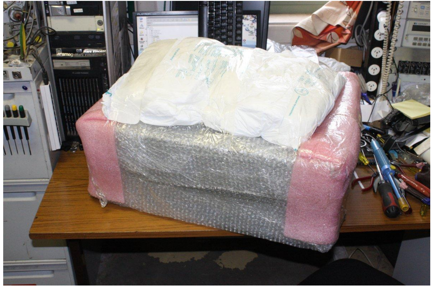
Oh oh. Only after pulling off these pink padding layers, I found the first small corner penetration. Rested the pink sheet back in place here for the photo to show orientation. (The roll of solder is acting as a weight to hold it in place for the photo.)

At home, out of the box. Still seems OK.