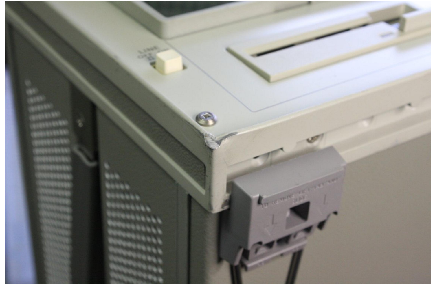
Box cardboard penetration from the lower left ding.